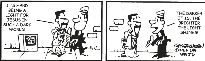
5TH SUNDAY IN ORDINARY TIME

Overlook a little, love a lot. To motivate yourself, you need to let go of the trivial. Ponder for one minute the possibility that your spouse might die next week. We can never be certain about the future.