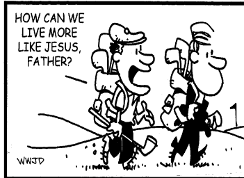
13 TH SUNDAY IN ORDINARY TIME

"I will follow you." (Luke 9:57) In couple dancing more often the man is the lead. Marriage, however, is more than a dance. It works best when both are adept at both leading and following as circumstances and talents dictate. How do you balance this in your marriage?